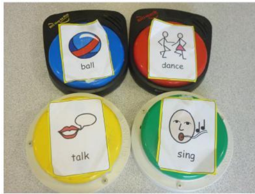
Fig. 1. Four Jellybean switches labelled with the symbols representing the micro-switches' action

or a joystick. In this way, executing the program corresponding to the server and running the appropriate behaviour in Choregraphe it was possible to tele-operate the robot with different input devices.