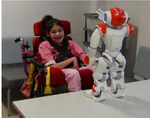
Fig. 2. A pupil working with the robot

discuss how this may be achieved. Information from these discussions was then used to individually design the sessions for each pupil, focussing on their interests and learning style, to help them achieve their learning objective. Figure 2 shows an example of how a pupil might be positioned to interact with the robot. Initial plans for the sessions were finalised with the teachers. However, depending on how sessions proceeded, plans could be refined. The main objective to be achieved over the four sessions could be broken down into smaller goals for each session.